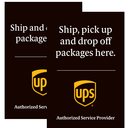
Indoor/Outdoor UPS Sign 1 sided | 24"W x 36"H AP or Non-AP