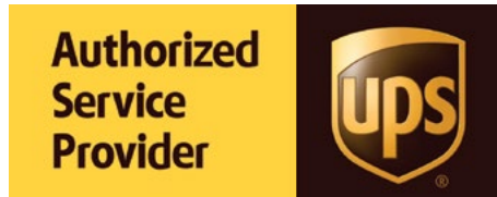
Indoor/Outdoor ASP Sign 2 sided | 36"W x 17"H