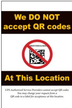
Indoor/Outdoor QR Code Signs 1 sided | 24"W x 36"H